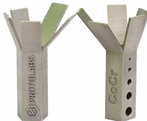
Fine Resolution 20µm